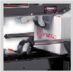
Self-centering side rails

Little David delivers packaging equipment that works for you