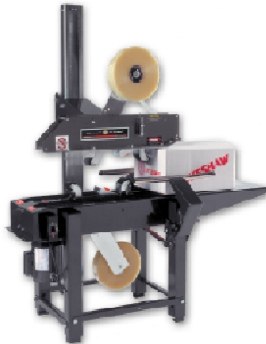
(Shown with optional pack table.)